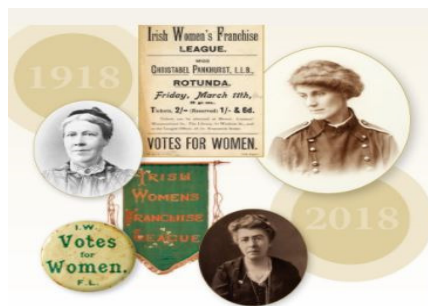
Programme of National Events at Oireachtas.ie

Please note that the AGM starts at 20.00hrs sharp. Non-members always welcome.